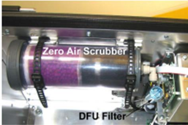
Location of the DFU Filter