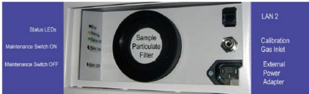
Inside the Maintenance Door of the airpointer®